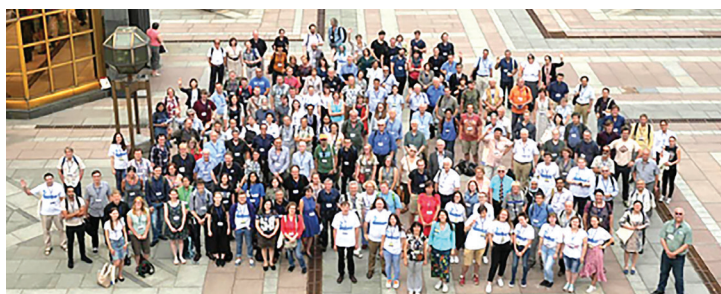
The MetSoc 2018 conference group photo.

The 81 st Annual Meeting of the Meteoritical Society (MetSoc) was held 22–27 July 2018 in Moscow (Russia). The conference was hosted in the Presidium of the Russian Academy of Sciences building, also called the “Golden Brains”. Some 302 participants from 28 different countries registered for the meeting, including 213 professionals (scientists plus exhibitors), 71 student participants, and 18 guests. A total of 164 registrants were MetSoc members. The MetSoc exhibition area also played host to the booths of publisher Springer, the journal Nature , and the analytical manufacturers of CAMECA and Textronica. In total, 358 abstracts were accepted for 204 oral and 154 poster presentations. Oral presentations were scheduled in three parallel sessions from Monday (22 July) to Friday (27 July), and all posters were on display for the entire duration of the conference.